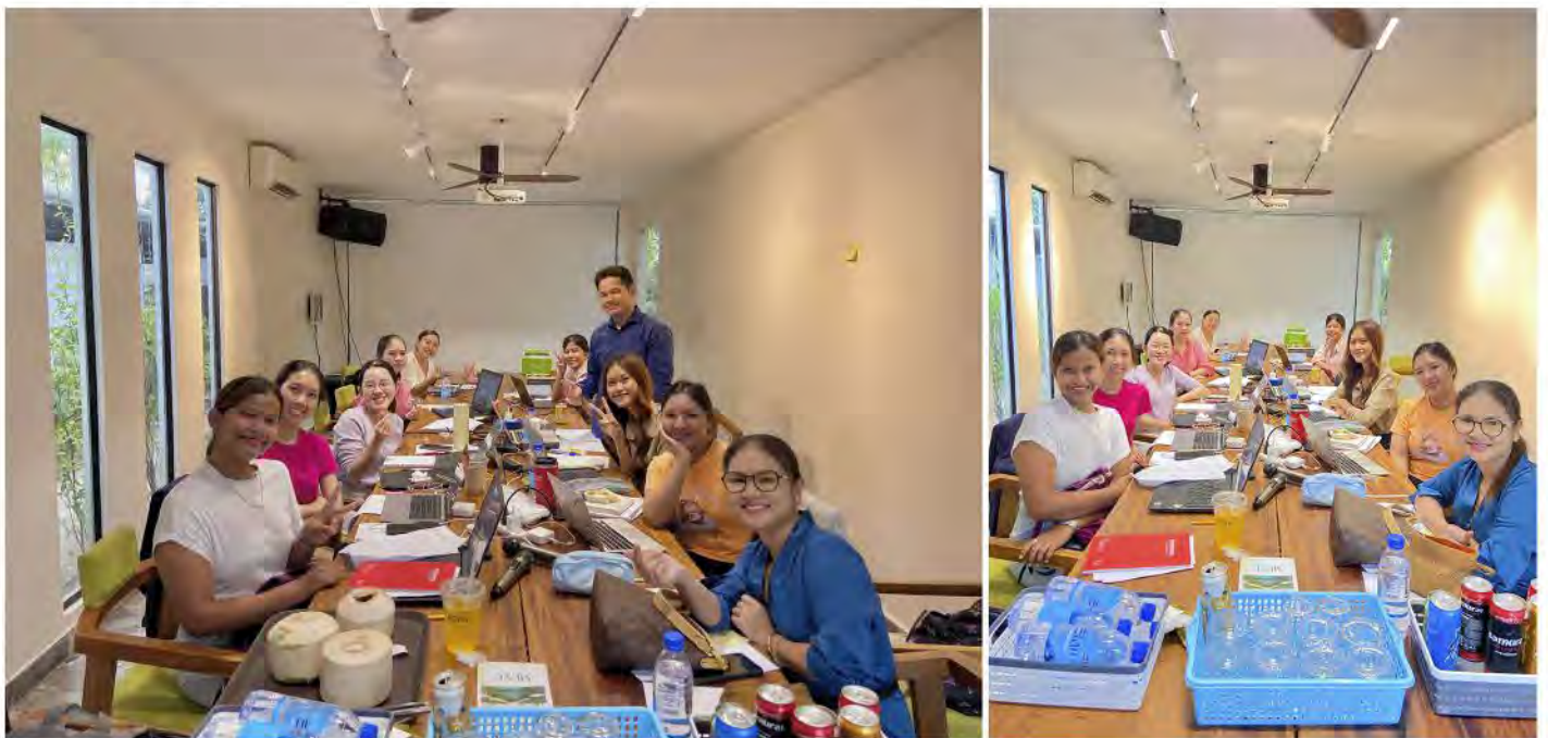
A successful team-building & strategic planning session was held at Preuk Sa, Phnom Penh, where our faculty members came together to reflect on the past year, set goals for 2025, and plan for the future of our department!