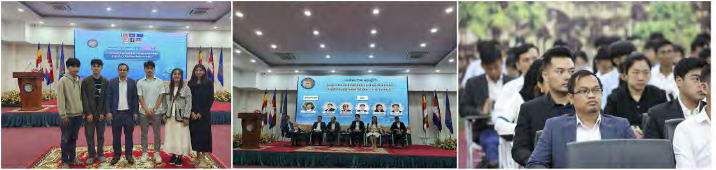
Faculty of ICT members and students joined The 4th Annual Technology Transfer Forum in Cambodia hosted by The Ministry of Industry, Science, Technology & Innovation (MISTI) .

The Forum focused on technology commercialization, bridging innovative technologies with showcase opportunities. This forum supports Cambodia's Science, Technology, and Innovation (STI) Roadmap 2030 and the Royal Government's Pentagonal Strategy-Phase I for socio-economic development. This year's forum discussed policy frameworks and support components necessary for promoting technology development and to foster collaboration between government, industry, and academia to drive commercialization efforts